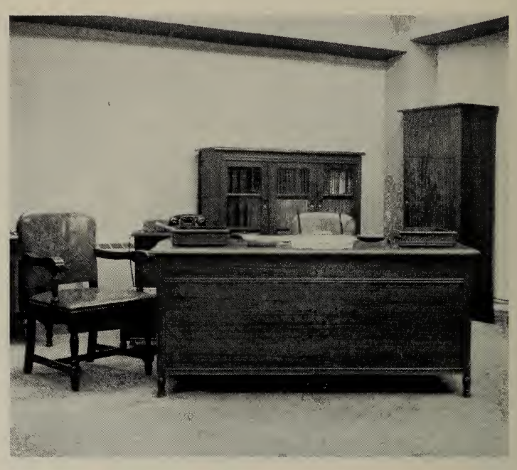
From raw materials fine furniture is manufactured at the Ontario Reformatory, Guelph.